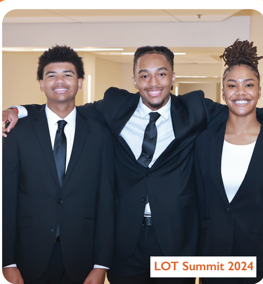
LOT Summit 2024

For over three decades (since 1991), LOT annually cultivates leadership and STEM skills in ~400 high school students across 25 markets through education, resources, and mentorship. Our program integrates five crucial areas: Leadership, Financial Literacy, College Readiness, Career Preparation, and Life Skills, preparing students for college, career, and beyond. The LOT Endowment secures this vital impact for future generations training, and educational opportunities.